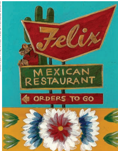
Clementine prayed over the queso., 2014